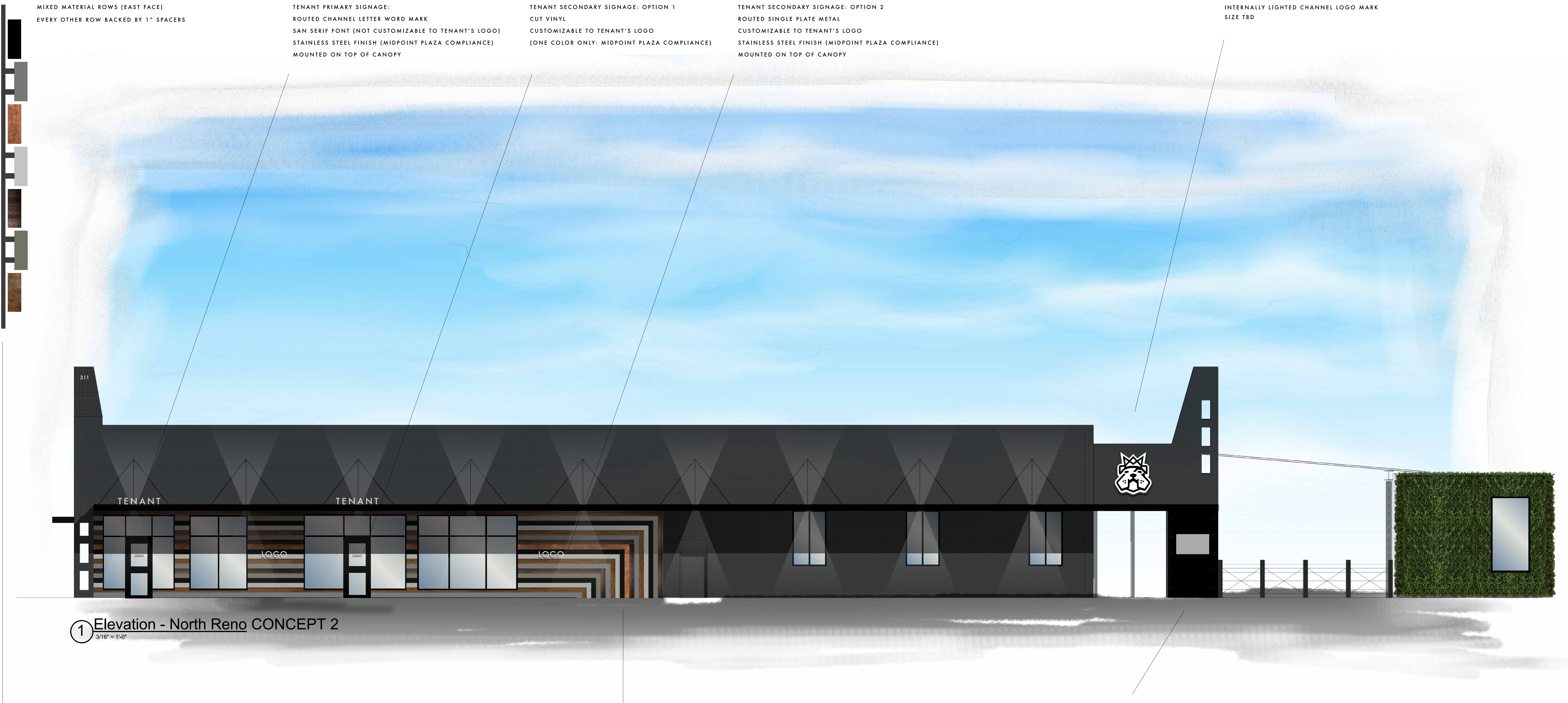
1 Elevation - North Reno CONCEPT 2 3/16" = 1'-0"

INTERNALLY LIGHTED CHANNEL LOGO MARK SIZE TBD